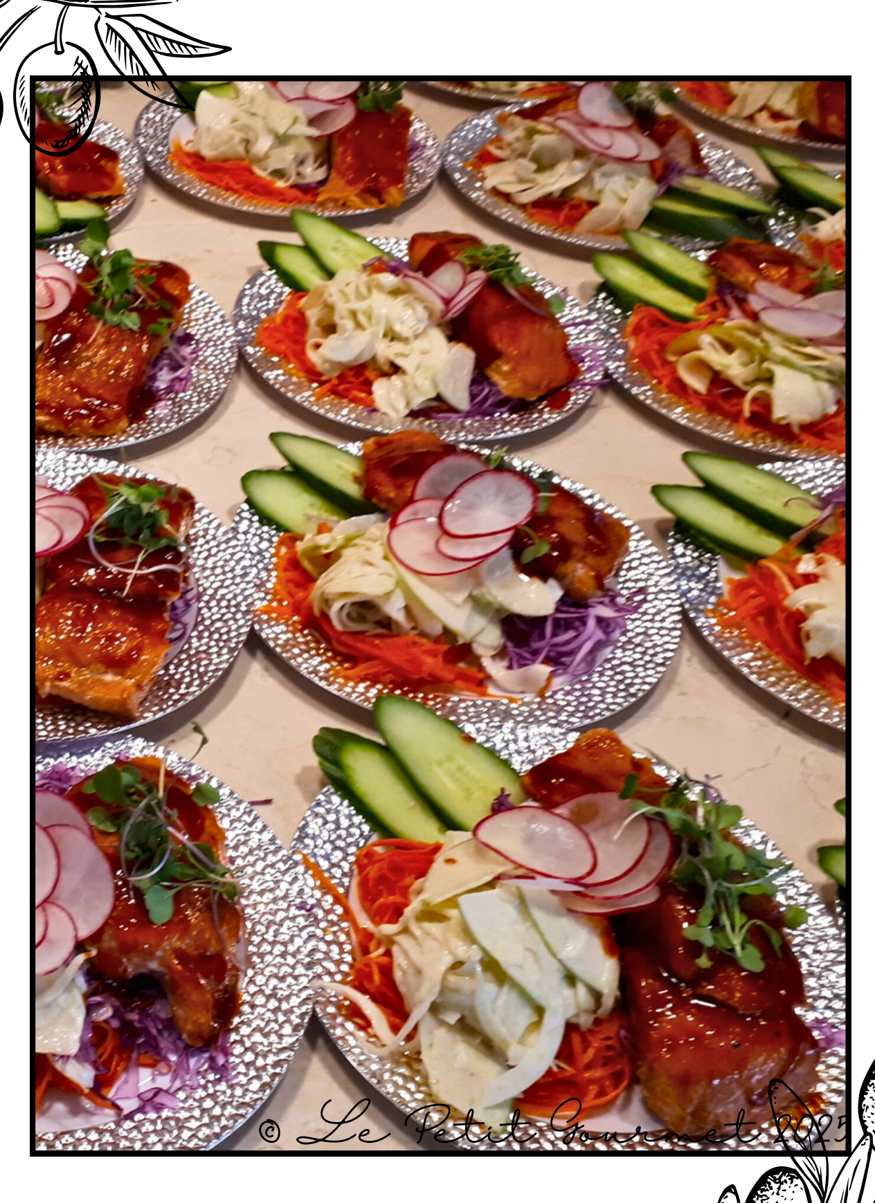
Glazed Salmon Fillet with Vegetables